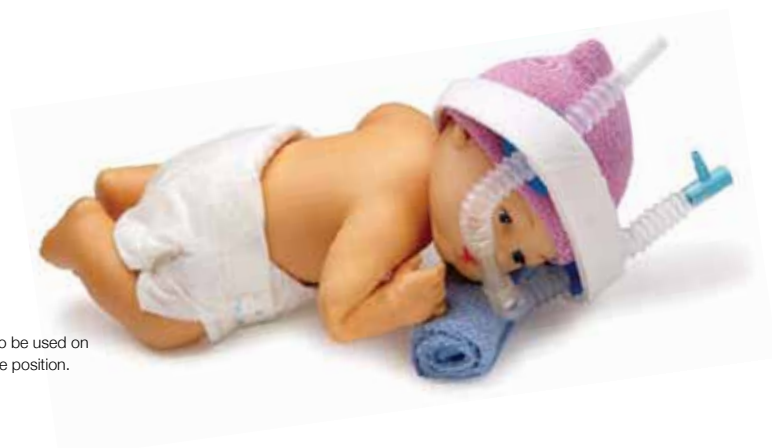
The INCA may also be used on a baby in the prone position.

Packaging: 5 sets per box, 20 (4 boxes) sets per case. Complete set is packaged in easy to open tray. Nasal prongs are packed sterile.